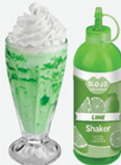
Lime Milkshake Syrup