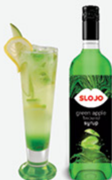
Green Apple Flavoured Syrup