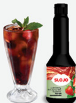
Strawberry Mint & Rooibos Flavoured Ice Tea Concentrate