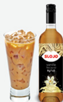
Vanilla Flavoured Syrup