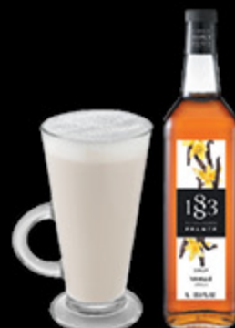
1883 Vanilla Syrup