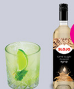
Cachaça, Cane Sugar and fresh lime