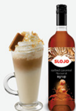
Salted Caramel Flavoured Syrup