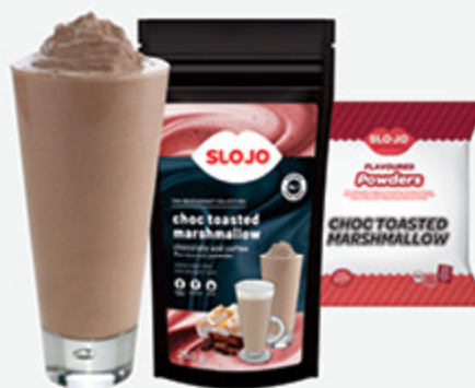
Choc Toasted Marshmallow Powder