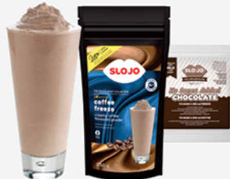
Skinny NSA Coffee Freezo Powder