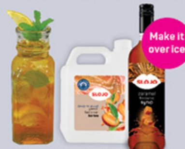
Syrup with an Ice Tea