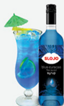
Blue Curacao Flavoured Syrup