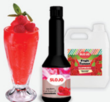
Raspberry Fruit Flavoured Concentrate