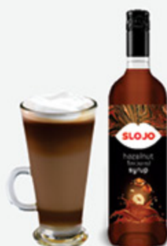
Hazelnut Flavoured Syrup