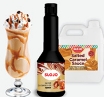
Salted Butterscotch Sauce