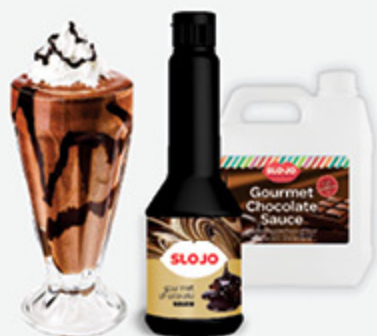
Gourmet Chocolate Sauce