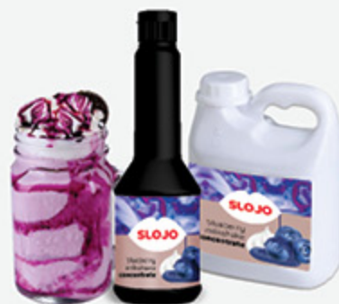
Blueberry Milkshake Concentrate