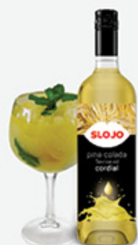
Pina Colada Flavoured Cordial