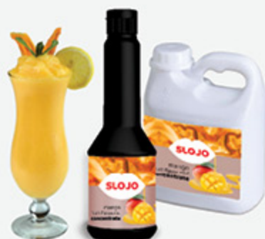
Mango Fruit Flavoured Concentrate