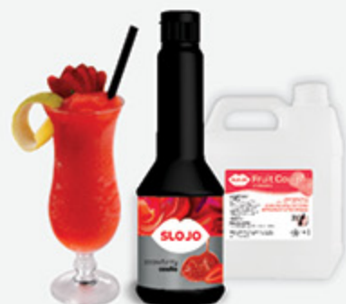
Strawberry Fruit Coulis