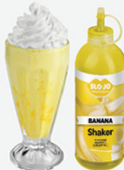
Banana Milkshake Syrup