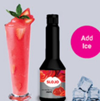
Ice and Fruit blend