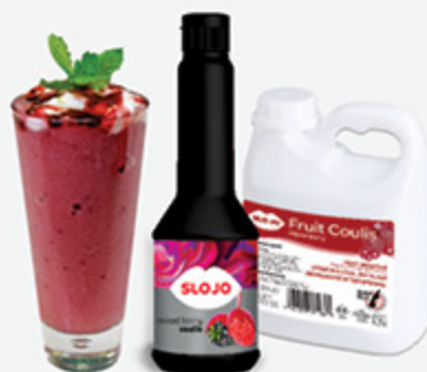
Mixed Berry Fruit Coulis