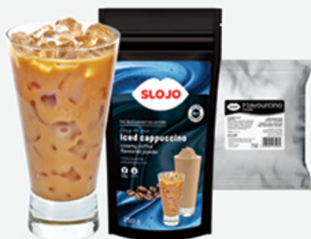
Iced Cappuccino Powder