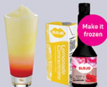
Lemonade and Fruit blend