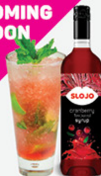
Cranberry Flavoured Syrup