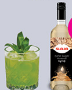
Gin, Cane Sugar, fresh lime juice and basil