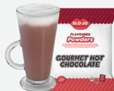
Gourmet Hot Chocolate Powder