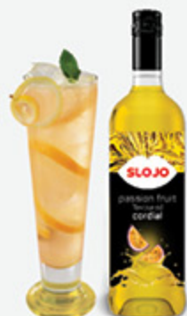
Passion Fruit Flavoured Cordial

CRUSHER OVER ICE GRANITA SLUSH DISPENSER