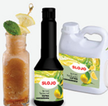
Lemon Ice Tea Concentrate