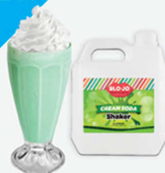
Cream Soda Milkshake Concentrate