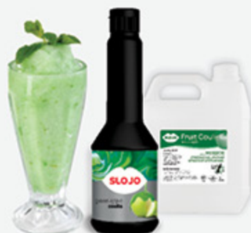
Green Apple Fruit Coulis