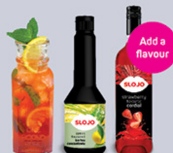
Ice Tea with a Cordial