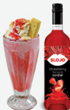
Strawberry Flavoured Cordial

CRUSHER OVER ICE GRANITA SLUSH DISPENSER