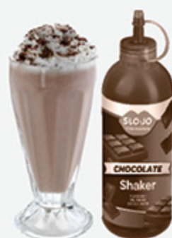
Chocolate Milkshake Syrup