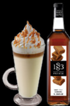
1883 Caramel Syrup