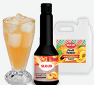
Peach Apricot Fruit Flavoured Concentrate