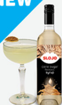
Cane Sugar Flavoured Syrup