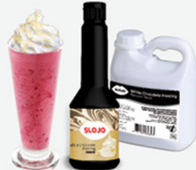
White Chocolate Frosting