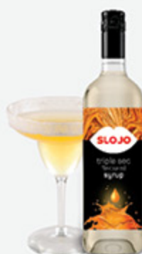
Triple Sec Flavoured Syrup