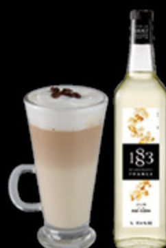
1883 Popcorn Syrup