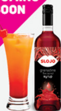
Grenadine Flavoured Syrup