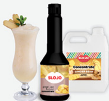
Ginger Beer Flavoured Concentrate