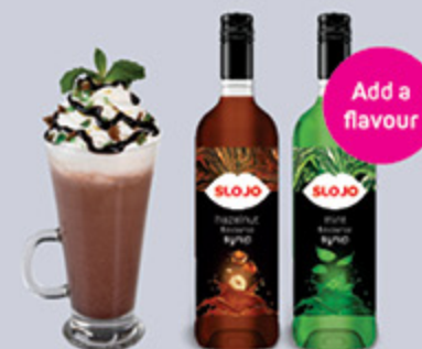
Flavour with Syrups