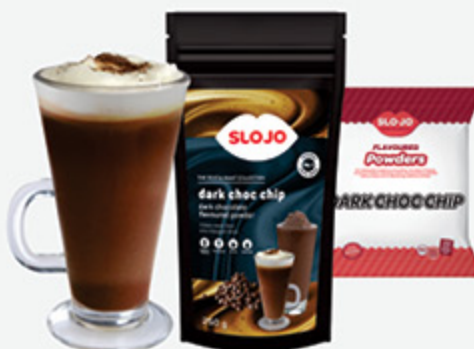
Dark Choc Chip Powder