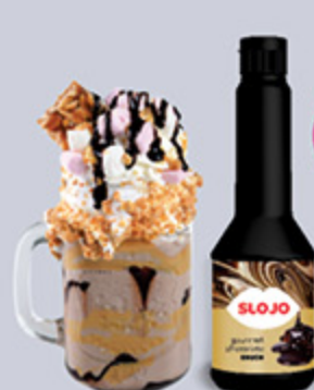
Sauce and Powder with various garnishes