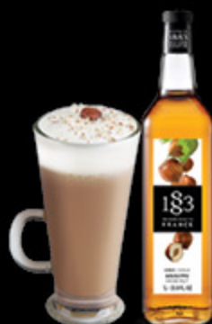
1883 Hazelnut Syrup