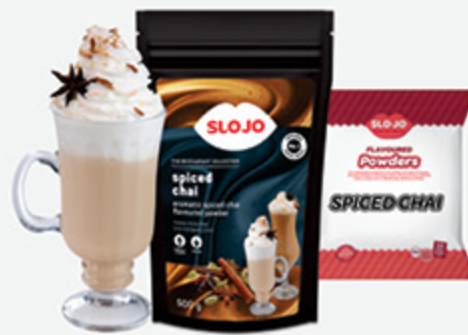
Spiced Chai Powder