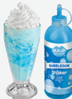
Bubblegum Milkshake Syrup