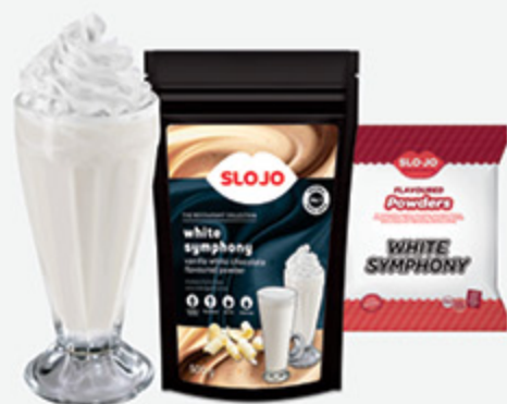
White Symphony Powder