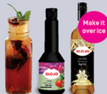
Ice Tea with a Syrup