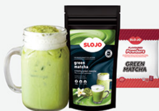
Green Matcha Powder