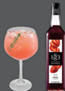
White and Dark Rum, Triple Sec and Almond