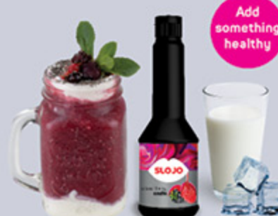
Fruit, Ice and Vegan Milk/Dairy Milk blend