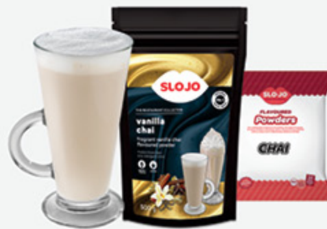
Vanilla Chai Powder