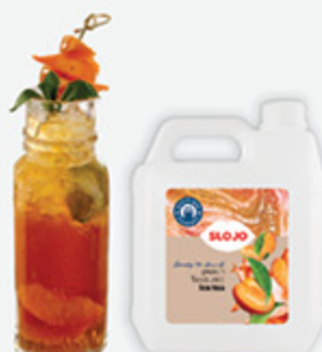
Ready To Drink Lemon Ice Tea Concentrate