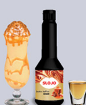
Add a shot of Frangelico/Amarula