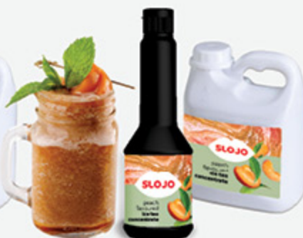
Peach Ice Tea Concentrate