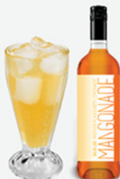
Mangonade Flavoured Lemonade