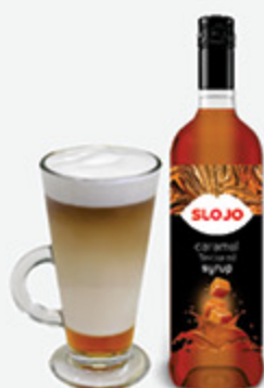
Caramel Flavoured Syrup