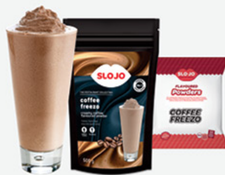
Coffee Freezo Powder