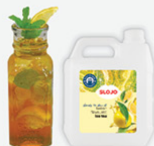
Ready To Drink Peach Ice Tea Concentrate