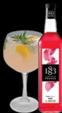
Rose and Orange G&T