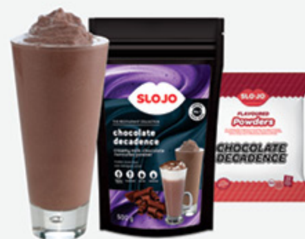
Chocolate Decadence Powder