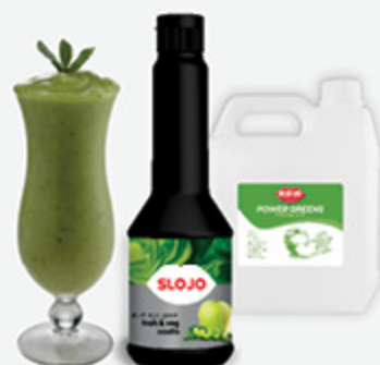
Fruit & Veg Coulis All things Green