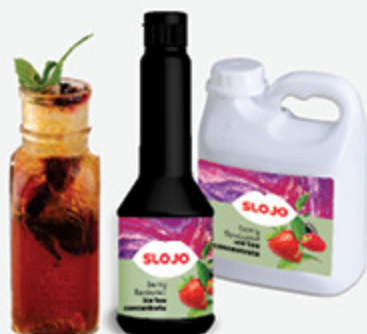
Berry Ice Tea Concentrate