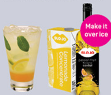
Lemonade with a Syrup