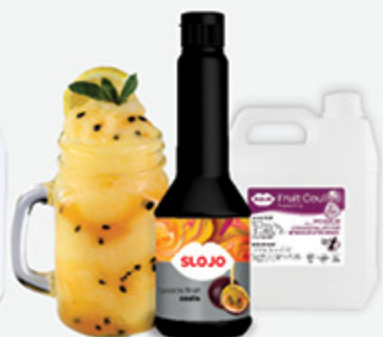
Passion Fruit Coulis