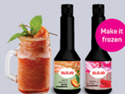
Ice Tea and Fruit blend