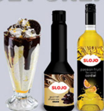
Sauce with a Cordial