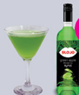
Vodka, Green Apple, Apple Juice and Lemon