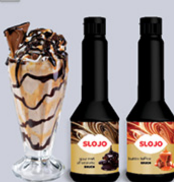
2 x Sauces and a texture