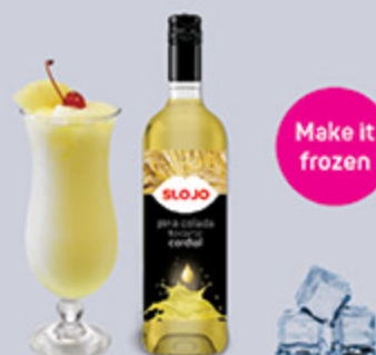
Cordial with Ice