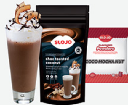
Choc Toasted Coconut Powder