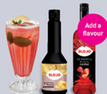
Fruit Concentrate with a Cordial