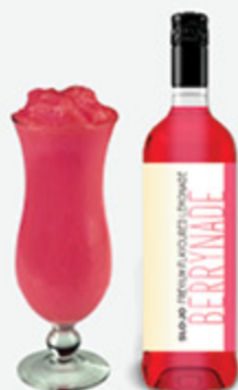
Berryade Flavoured Lemonade