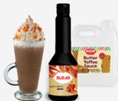
Butter Toffee Sauce