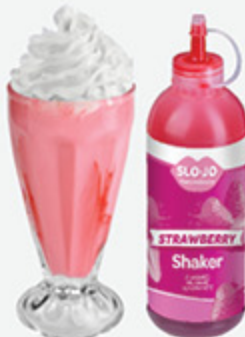
Strawberry Milkshake Syrup