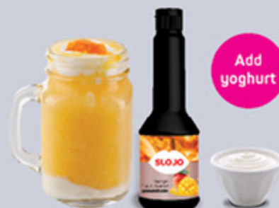
Yoghurt and Fruit blend