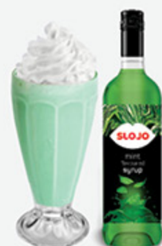
Mint Flavoured Syrup