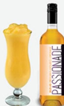
Passionade Flavoured Lemonade