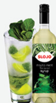
Mojito Mint Flavoured Syrup