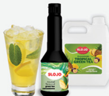
Tropical Green Ice Tea Concentrate